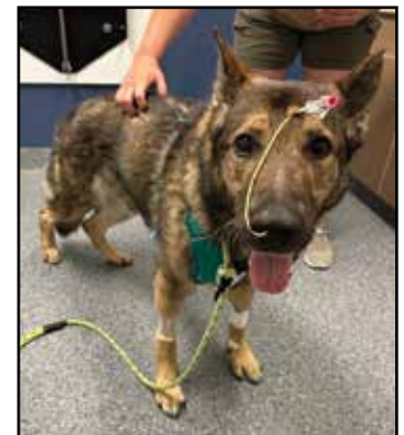
Paws of Honor and kind friends like you provided K9 Tex with nearly $6,000 in lifesaving medical care, free of charge to his handler.

– highlighting all the good your generosity is doing for America's best friends!