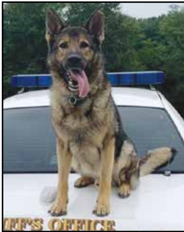
K9 Tex served the Frederick County Sheriff's Office in Virginia as a Dual-Purpose Patrol/Tracking and Narcotics K9 for nearly seven years.

Meet K9 Tex , one of the 370 retired hero pups Paws of Honor is proud to support in their sunset years. Tex loved to work, and served the Frederick County Sheriff's Office in Virginia as a Dual-Purpose Patrol/Tracking and Narcotics K9 for nearly seven years. He is credited with numerous criminal apprehensions as well as hundreds of drug-related finds and arrests!