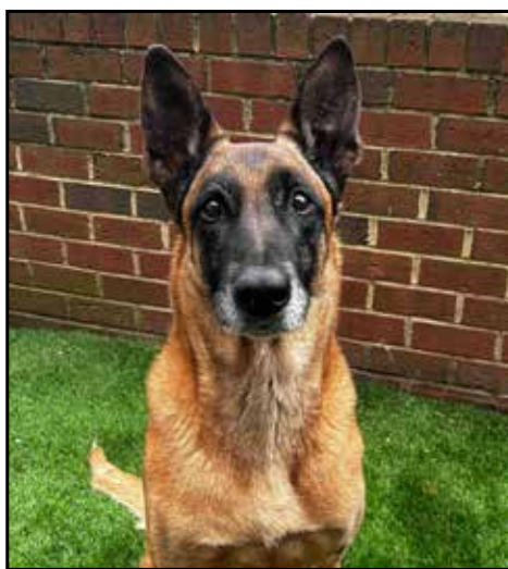
My life was saved by emergency surgery paid for by caring friends like you. ~Impulse

been favorable. Fortunately, the surgery was successful.