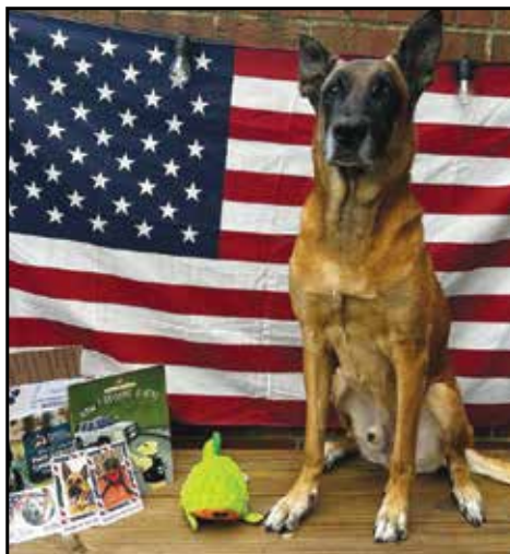
Hi! I'm retired Military Working Dog (MWD) Impulse. I served in the U.S. Army and appreciate the support you have shown to me and my other four-legged friends in our retirement.

This past fall, Impulse went to an animal clinic for an ultrasound after his bloodwork returned elevated during a routine check. During that ultrasound, a mass was found on his spleen. Impulse needed surgery immediately. At the start of surgery, the mass ruptured. The doctor said if he hadn't had surgery when he did, the outcome would not have